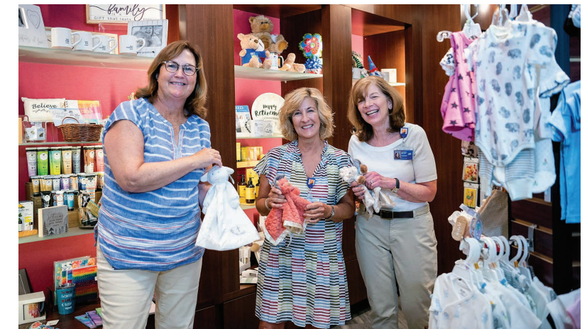
Auxiliary volunteers in The Gift Shop & Bloom keep this shopping mecca fresh and fun seven days a week for visitors and staff.